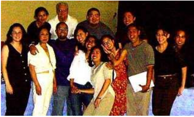
The cast and staff of The Goddess of Flowers .