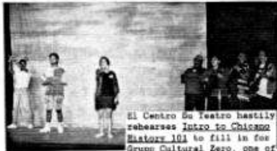
El Centro de Teatro hastily rehearses Intro to Chicano History 101 to fill in for Grupo Cultural Zero, one of whose members was stuck in Mexico.